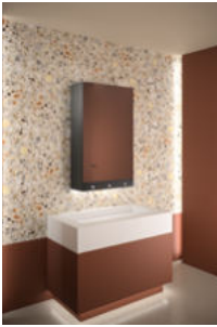
Individual installation 4-in-1 cabinet